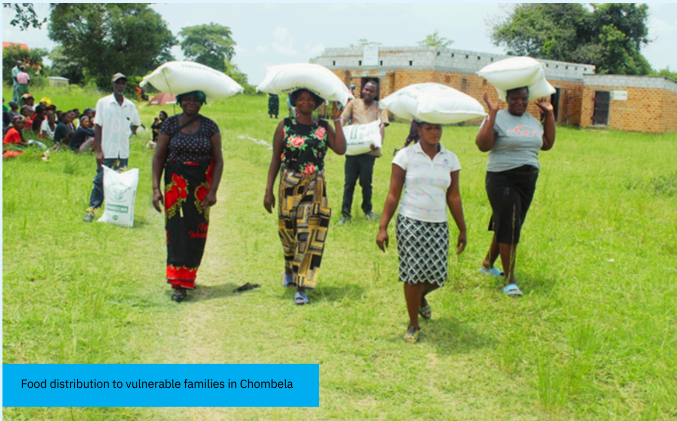
Food distribution to vulnerable families in Chombela

Chibombo District, Zambia – In a significant stride towards alleviating the impact of the El Nino-induced drought, SOS Children's Villages in Zambia launched a humanitarian project in Chombela Community.